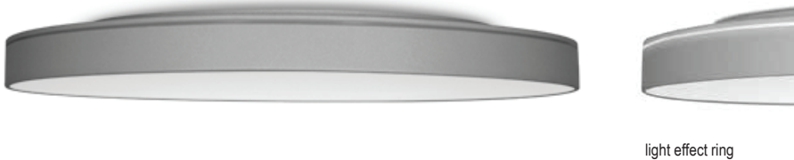
light effect ring

Uniquely versatile for innovative lighting concepts. Sophisticated design with a clear, flat, geometric language of form – these fixtures have been conceived for representative rooms, communicative meeting areas and reception areas of office buildings and hotels. Apart from the direct or indirect light from behind the luminaire, the light effect ring enables you to implement fascinating effects. In an arrangement slightly offset from the ceiling, Lunata conveys an airy and floating spatial impression.